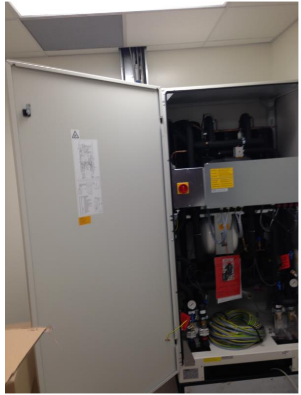
Siemens interior cooler cabinet.