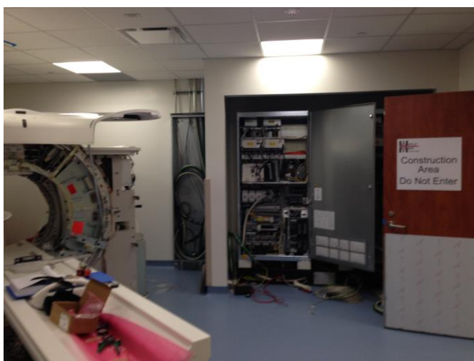
Equipment closet cabinet installation